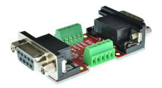
Figure 4: D9-F-M-V1A with terminal blocks