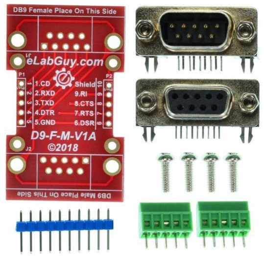
Figure 1: Parts inside the kit (Note: the module is not assembled, user can decide which connector to use on the module.)